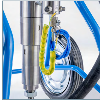
HERKULES material pump

Whether the material for your application needs to be agitated or heated, or you want to feed it via a feed tank, WIWA provides a comprehensive range of accessories for our HERKULES pumps , both for the pneumatic and the hydraulic variants. For requirements that go beyond the standard, we always find a suitable solution.