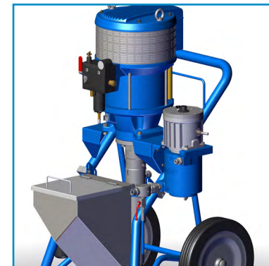
WIWA HERKULES GX with feed hopper