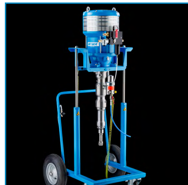
WIWA HERKULES GX on elevator